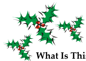
TABLE TALK – coming in January

What Is This? As we continue this year, 2017, to commemorate the Anniversary of the Reformation, we will gather on Wednesdays at 5:30 to eat a simple meal together and to discuss matters of religious importance facing life each day. While this might seem like a weighty matter, it is a weighty matter. There is little opportunity for one to voice one's questions, to query of each other, and of the Bible, God's Word, regarding current situations, and the understanding of living life now..... In the style of Martin Luther, we will gather around a table and discuss religious matters. We will use the Word of God, the lessons for the coming Sunday, as the opening of our conversations.