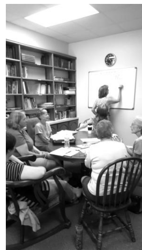
Worship & Music Ministry at work!