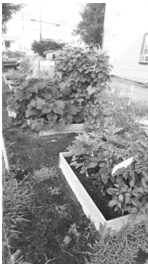
Veggies growing and being harvested!