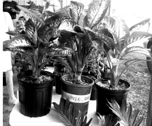
We will be selling plants at the Festival on August 13. Come see what we have.