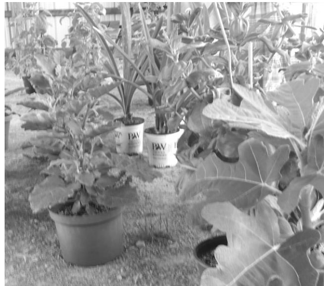
Easter Egg plants for sale.