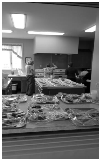
Dinners and helpers in the kitchen.