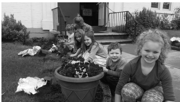
Sunday School children planting geraniums on May 22 nd .