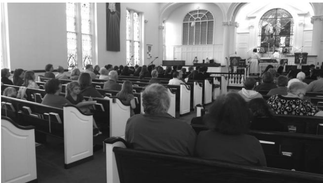
Attendees at the Day of Pentecost Worship May 15, 2016