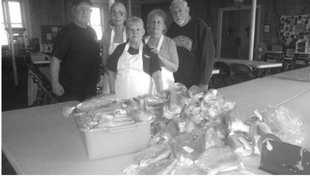
Some of the assemblers for the Kidsville Hoagie Fundraiser.