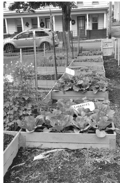
Cabbage, carrots, beets, tomatoes, Lettuce, zucchini, etc. It's looking great!