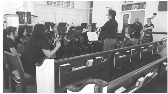
Boyertown High School String Ensemble