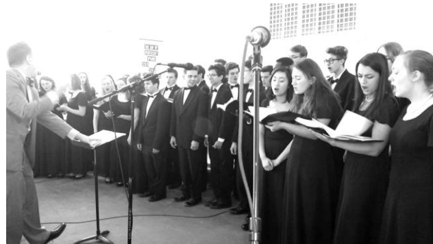
Boyertown High School Choir