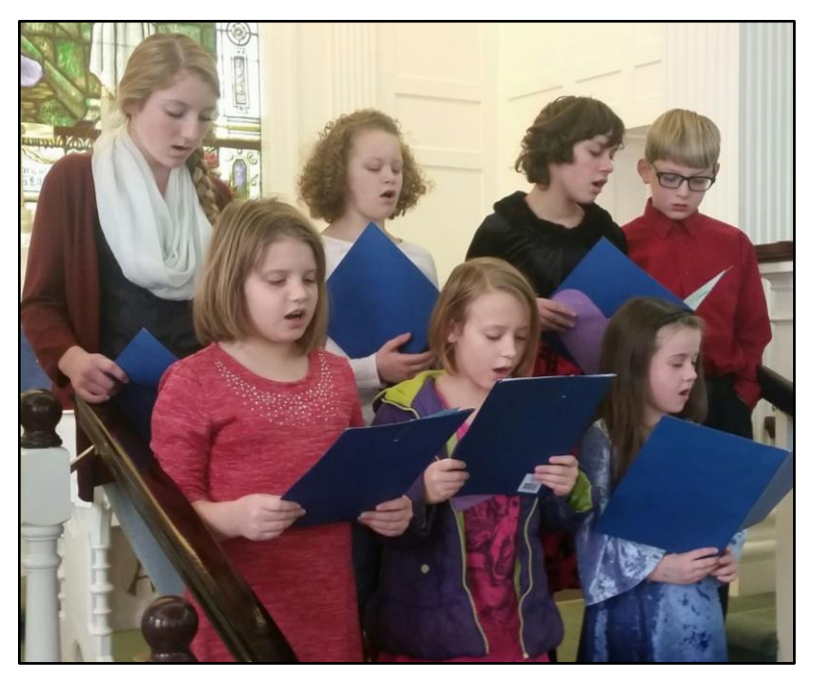
The Children's Choir