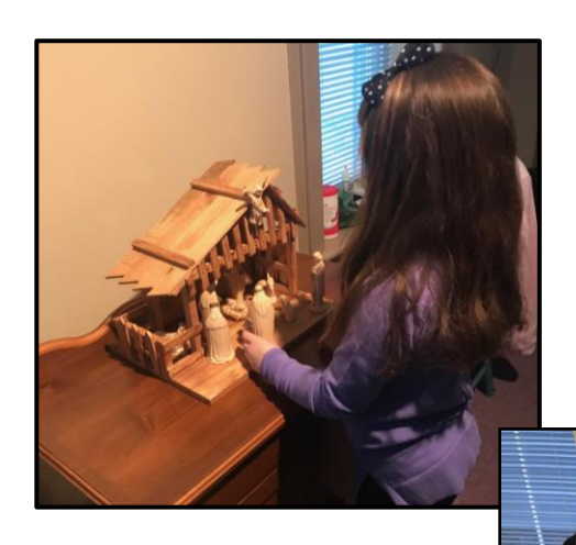
Children's Sunday School putting manger scene together on Christmas Eve.