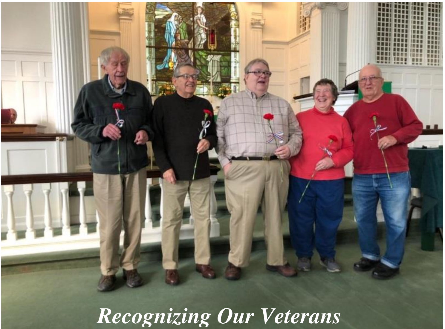
Recognizing Our Veterans