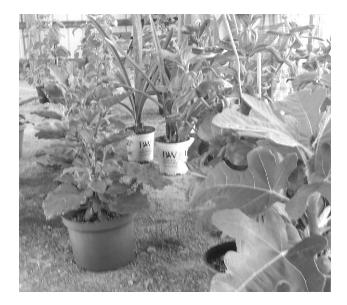
Easter Egg plants for sale.

The organ loft at the church in Ft. Wayne, Indiana.