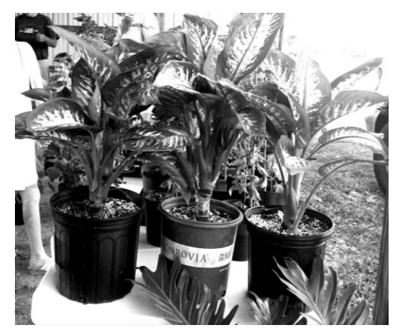
We will be selling plants at the Festival on August 13. Come see what we have.